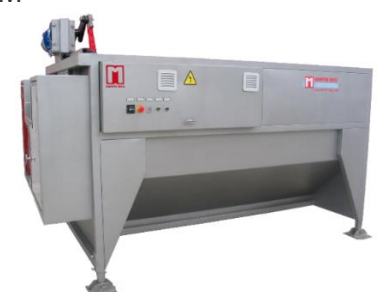
LPR830 / LPR830M

The new generation of LPR series polishers, with their revolutionary working system, are capable of polishing all type of vegetable and citrus, with a high performance and without causing any damage to the product.